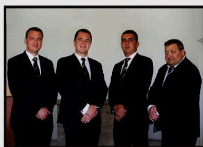
Professional, Experienced, and Compassionate Funeral Directors

Adriano Coluccio Funerals is a family owned business and offers professional and affordable funeral services.