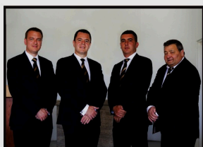
Professional, Experienced, and Compassionate Funeral Directors

Adriano Coluccio Funerals is a family owned business and offers professional and affordable funeral services.